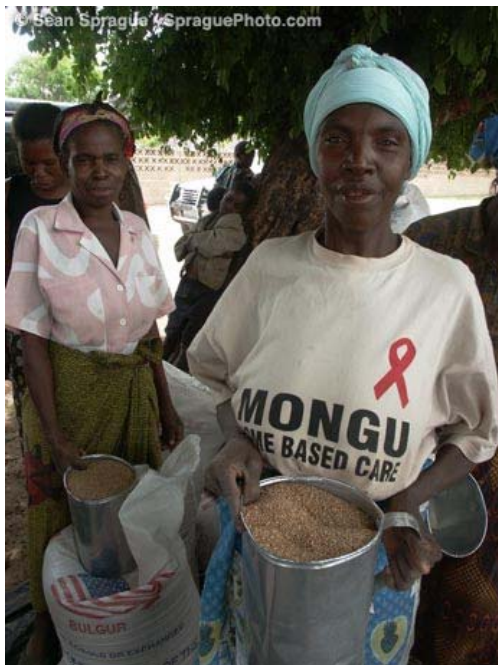
Distribution of American Catholic Relief Services food aid at a center in Mongu, Zambia, during a time of drought and famine. Here’s the work CRS does best.

These examples of distorted, worldly viewpoints – absorbed by CRS and regurgitated as “Catholic” positions – explain CRS’s ubiquitous presence on the Faith in Public Life map of progressive institutions, among pro-abortion and homosexual “rights” advocates. They mar CRS’s Catholic work, however. ☹