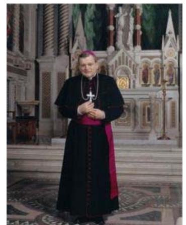
Archbishop Raymond Burke of St. Louis