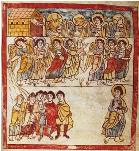
Wedding Feast of the Lamb

We taste the first fruits of this in the story of Ruth, the parable of the Prodigal Son, the life of Christ, and the creation of the Church at Pentecost. ☩