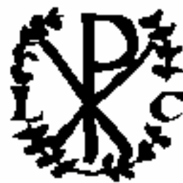
Cover: "Angelus" by Jean-Francois Millet