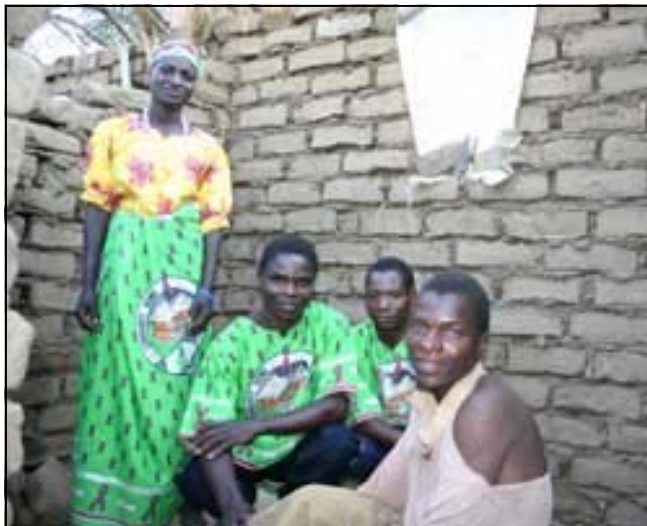
Home-based care volunteers for the Roman Catholic diocese of Dedza, a partner of Catholic Relief Services , visiting an AIDS patient. They are in the unfinished mud brick house they helped build.

In “Section 1: Prevention,” the treatment of condoms begins: “Referrals for condoms” (p. 45). It provides a bit of information: “Condoms, when used consistently and correctly, have been shown to reduce the risk of transmission of HIV, STIs and HIV re-infection.” It immediately adds: “Explain to the client where condoms are available and where they can get more information” (p. 46). It goes on with precise directions, illustrated with graphics of cartoon figures, for using and disposing of male condoms (pp. 47-48) and female condoms (pp. 49-50). The section is rounded out with an en-