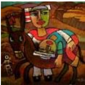
The Good Samaritan

We do live by the rule of law. We are all subject to the Constitution, its amendments, and the legitimate laws and precedents established by our legislators and judges. All power and authority come from God himself. The government has a legitimate obligation to protect our borders and boundaries from criminals, from terrorists, from invading armies bent on conquest. Do illegal