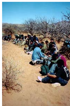
A group resting during an attempt to cross the desert and enter the United States