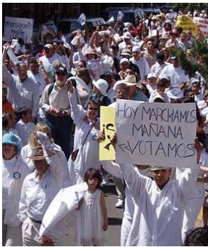
“Today we march; tomorrow we vote”

Furthermore, it utilized the standard liberationist technique of conscientizing and legitimating a political position by associating it with a cherished religious image: at the 12th station, where the worshipper is to meditate on the death of Jesus, the congregation prayed “for all those who have died trying to cross the border in search of a better life in the United States.” [Michelle Martin, “Immigration reform efforts, prayers continue,” Catholic New World , Archdiocesan paper of Chicago, April 16, 2006] Our Lady of Tepeyac Catholic Church is also a member of UPAJ. ☺