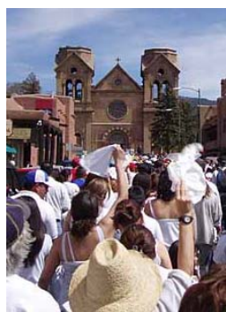
In Santa Fe, marchers head for the Basilica of St. Francis