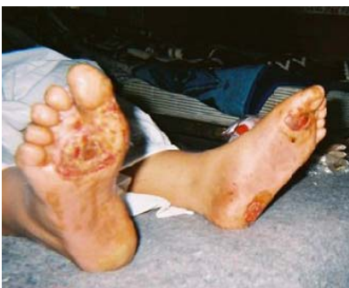
The blistered feet of an illegal immigrant

This special issue of the Pepper has been prepared to explore some of the topical concerns of illegal immigration in the United States. 🌐